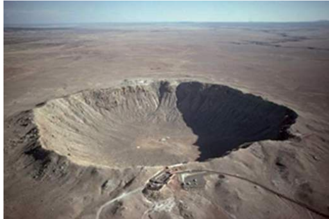
Figure 3: Image of an impact event on the Earth