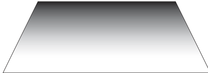
Figure 5: A possible geometry for spacetime