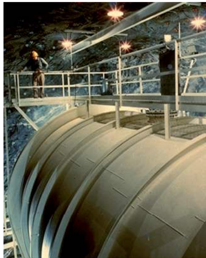
Figure 2: The Homestake solar neutrino detector

Briefly explain why the detection of solar neutrinos is important in understanding the nuclear fusion rate occurring at this moment in time. [2]