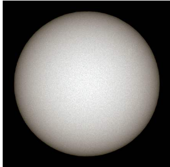
Figure 1: Limb darkening on the solar surface

Briefly explain why limb darkening occurs. You may find that a sketch will help you.